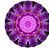
11. Galactic Chakra