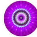
10. Universal Chakra