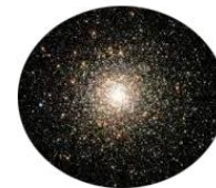
0. Earth Star